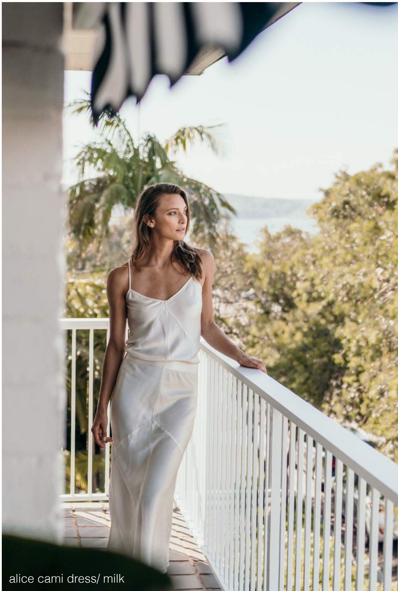
alice cami dress/ milk