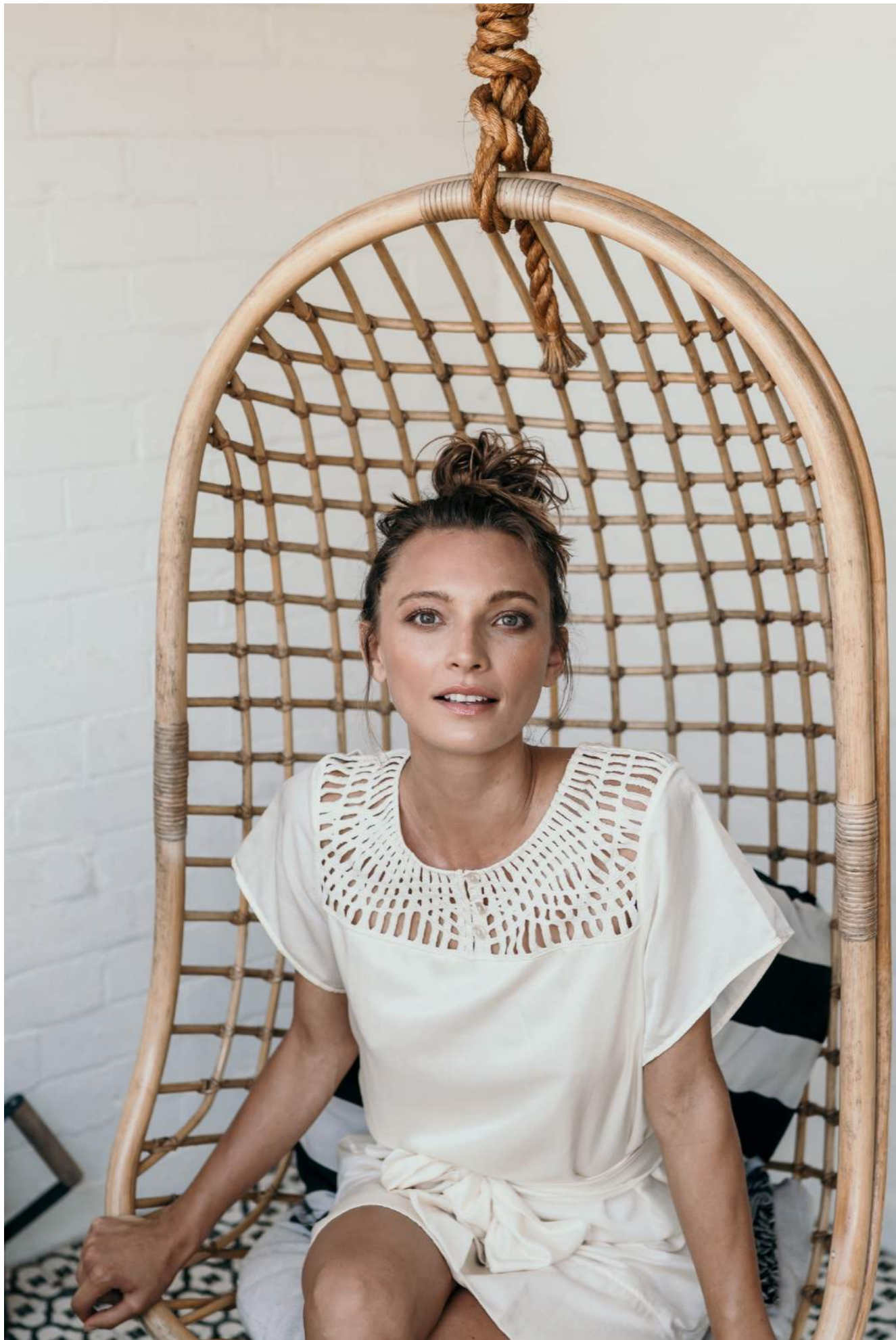
riverstones tunic/ natural