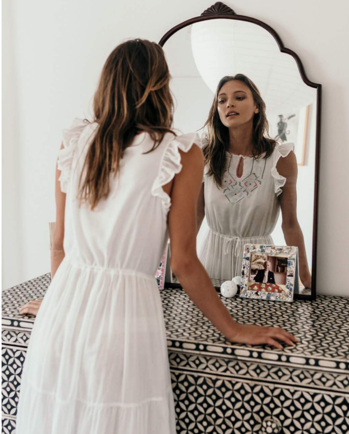
ciara sleeveless dress/ milk