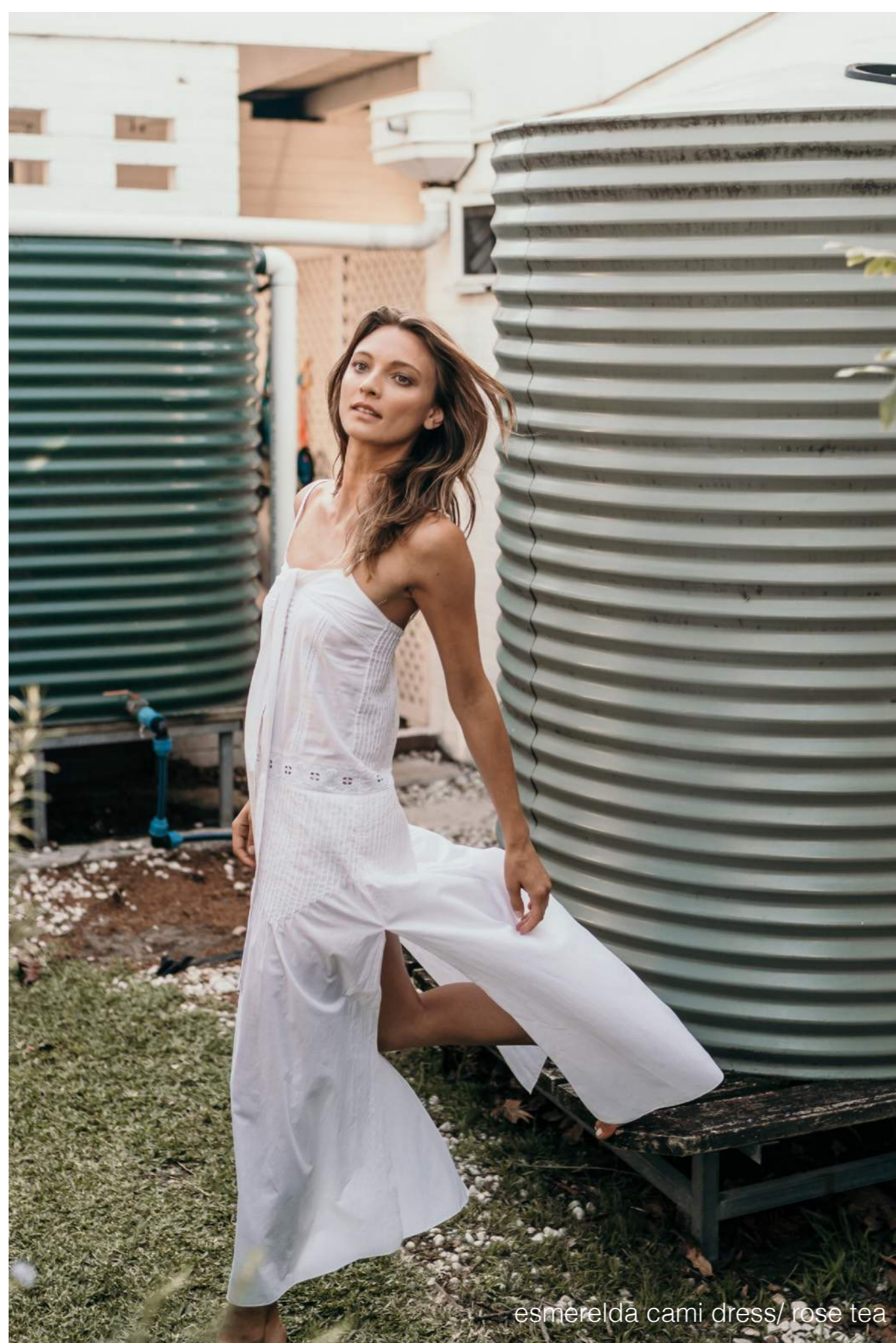
esmerelda cami dress/ rose tea