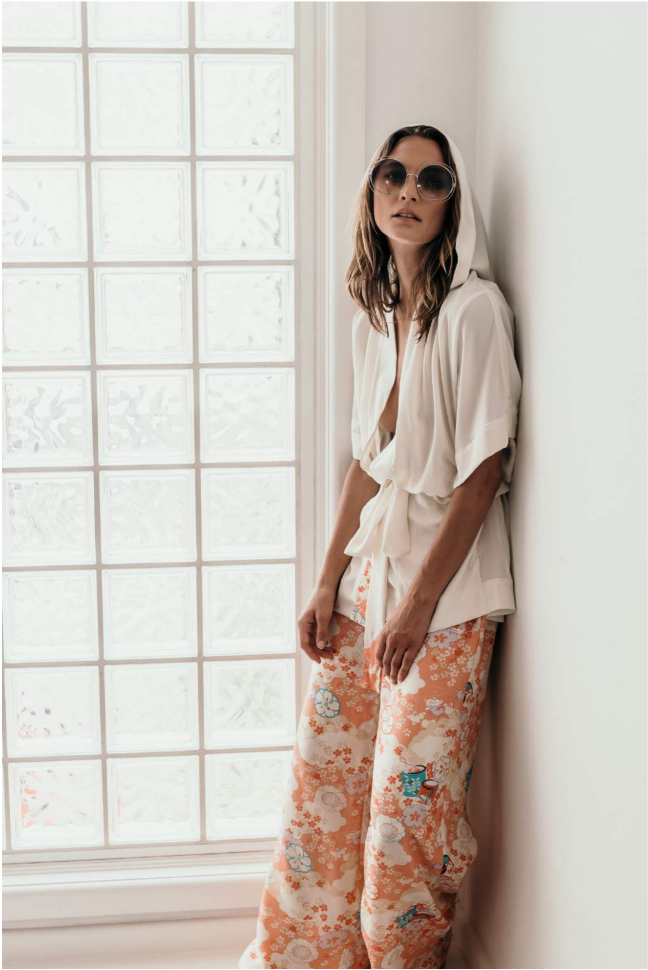
aster wide leg pant/ blossom print girt by sea robe/ natural