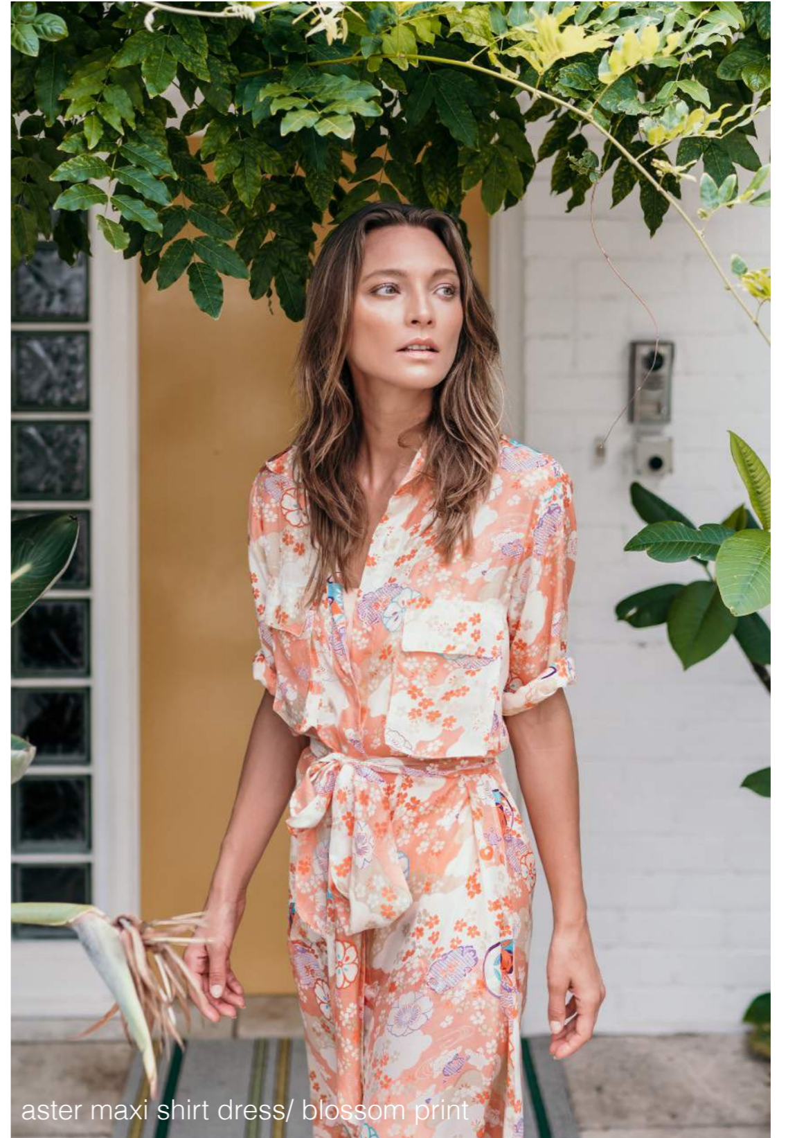
aster maxi shirt dress/ blossom print