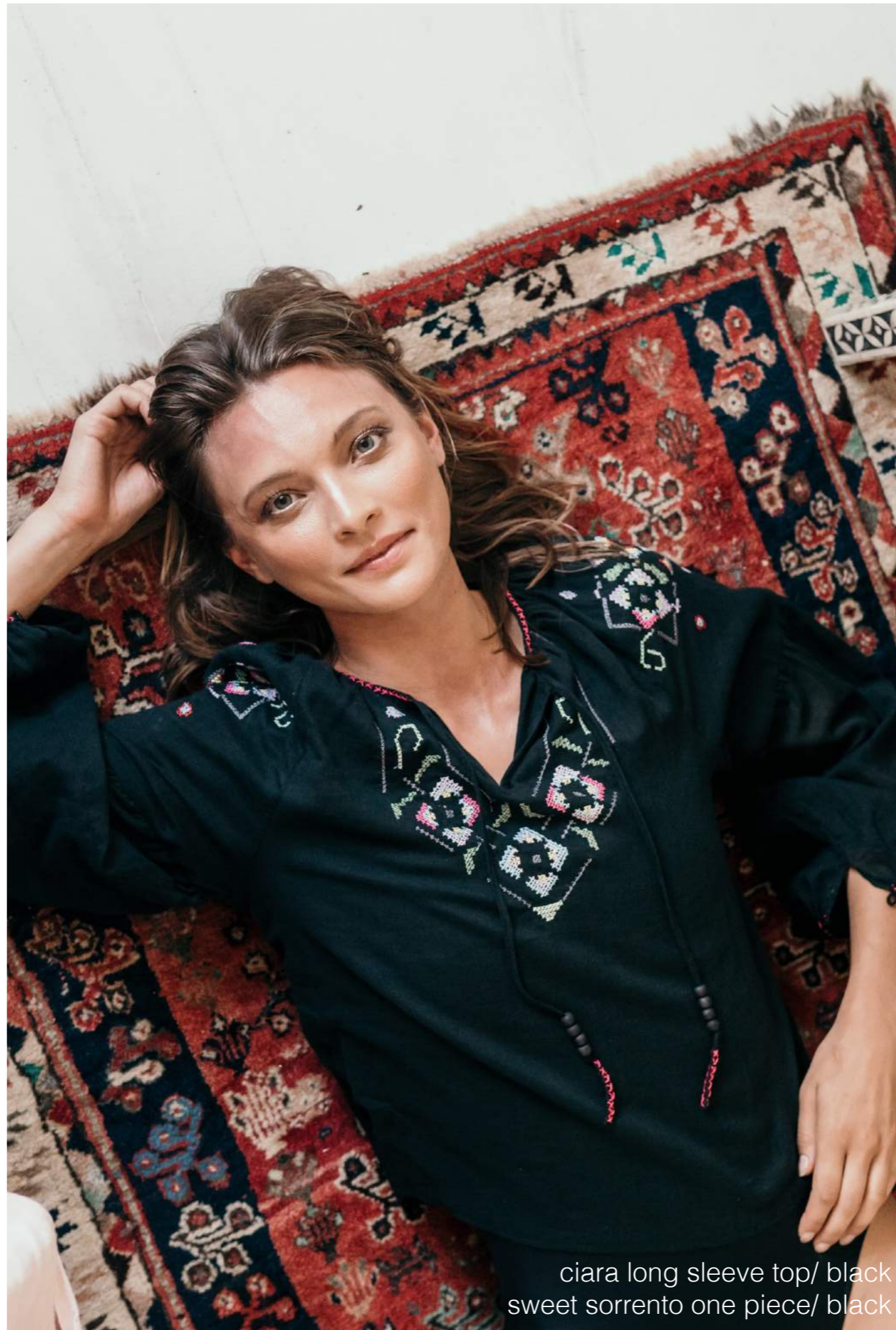
ciara long sleeve top/ black sweet sorrento one piece/ black