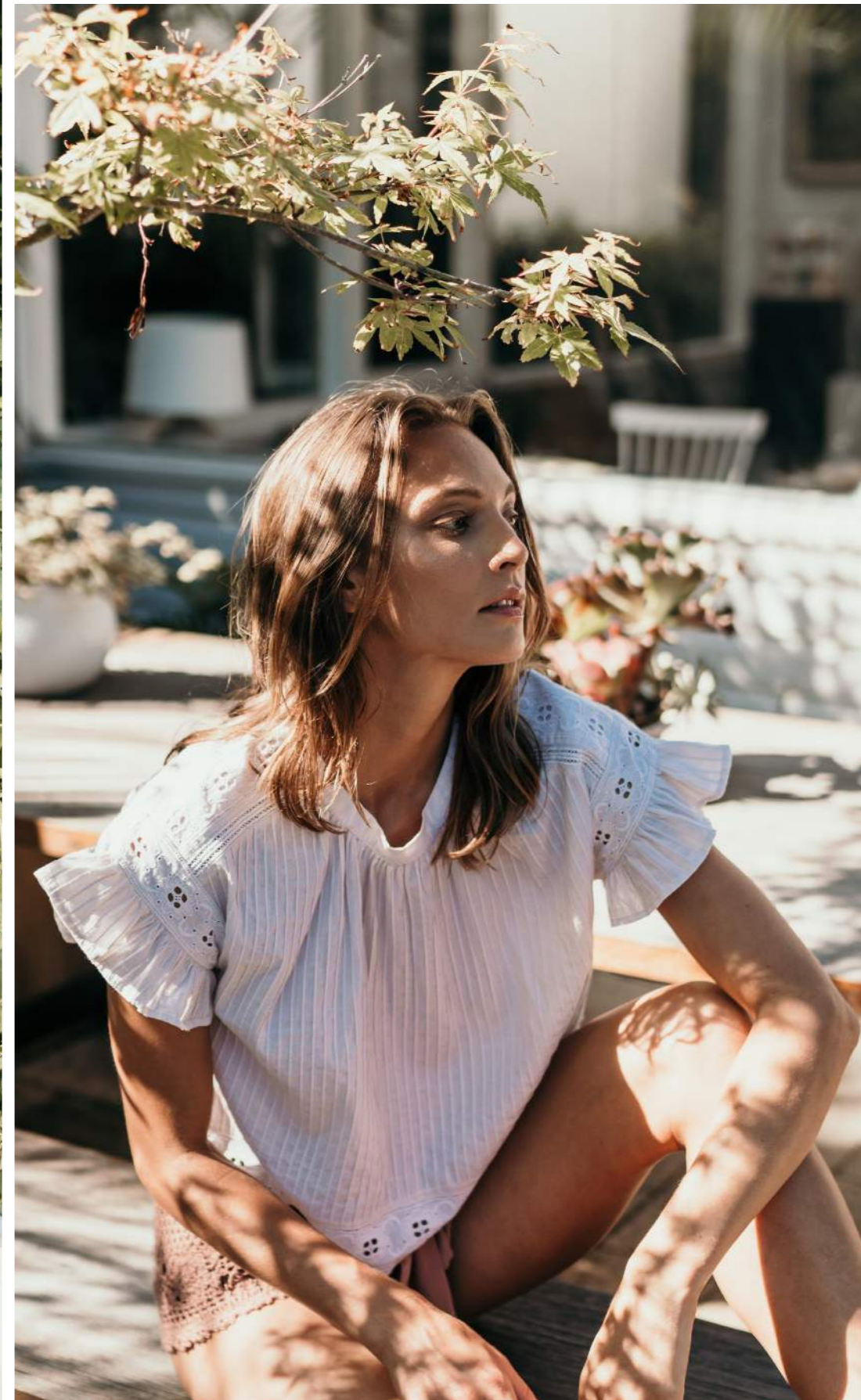
esmerelda short sleeve top/ rose tea starling shorts/ rose