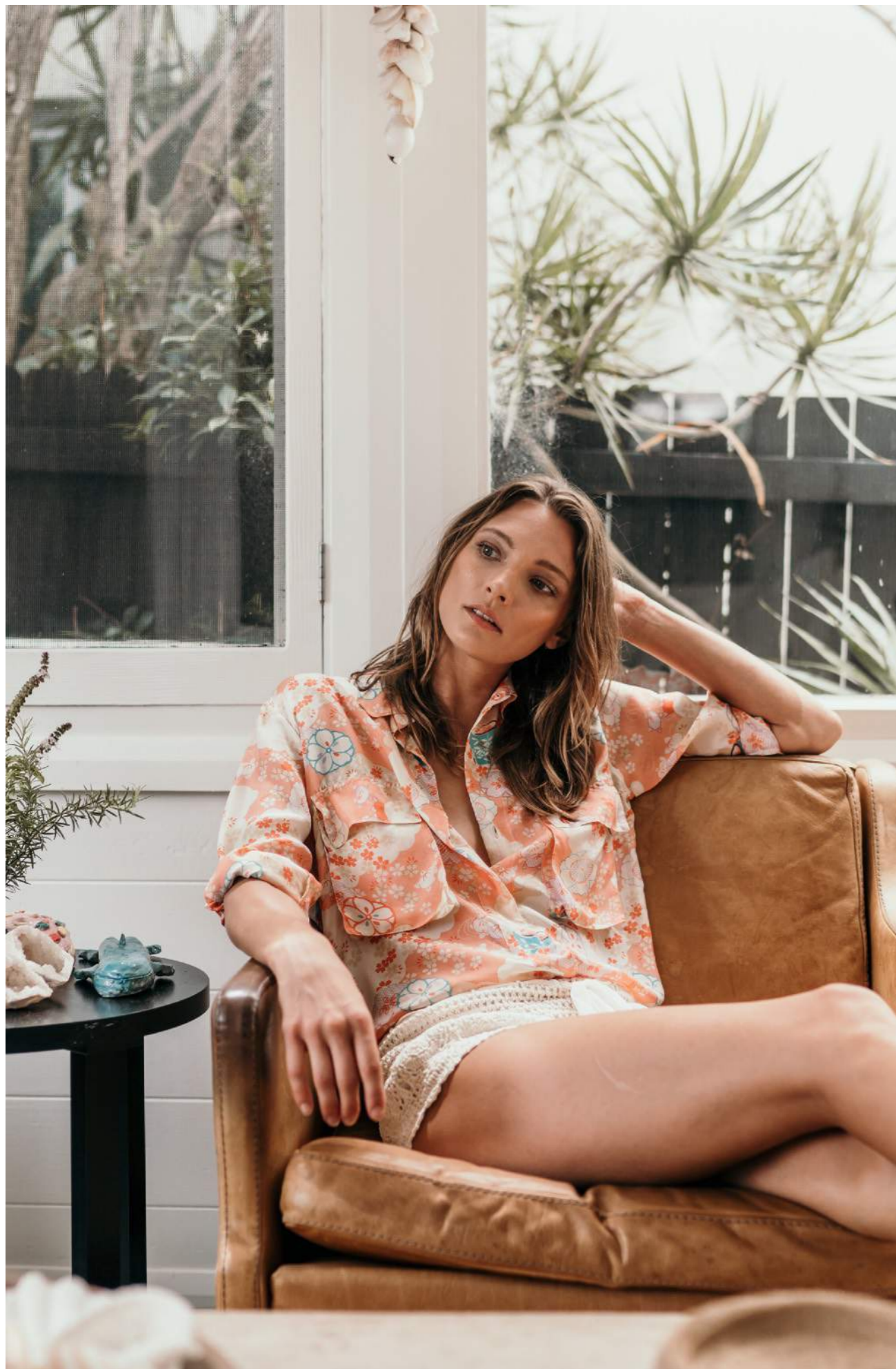
aster shirt/ blossom print starling short/ milk