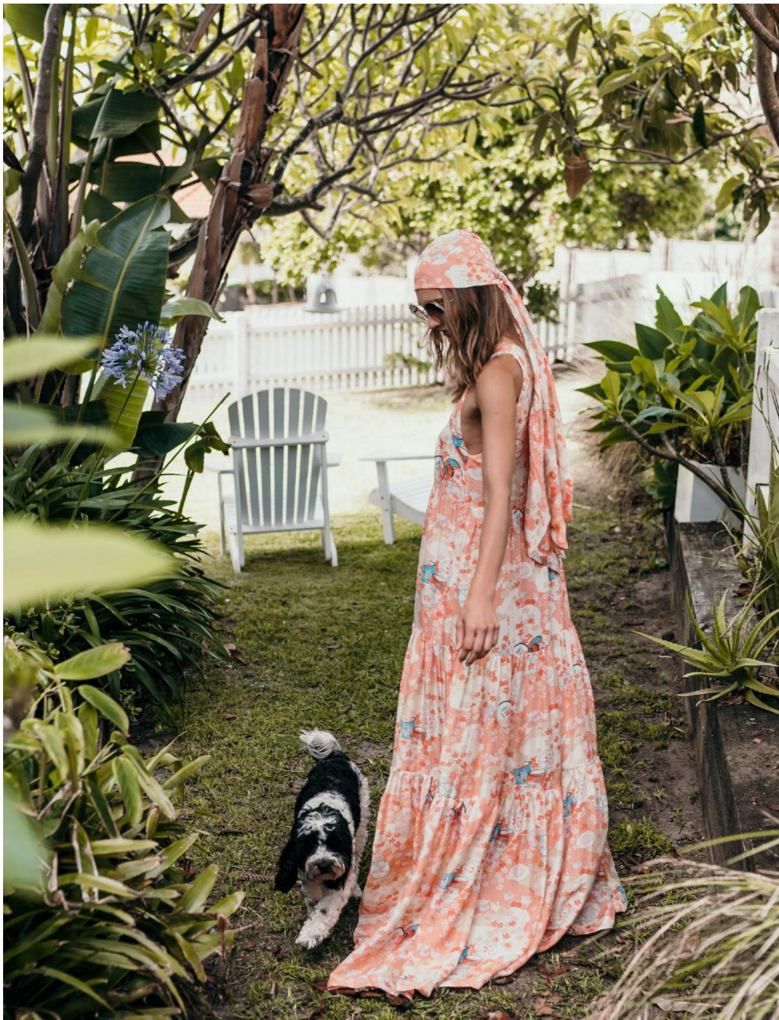
aster sleeveless maxi/ blossom print aster scarf tie top/ blossom print