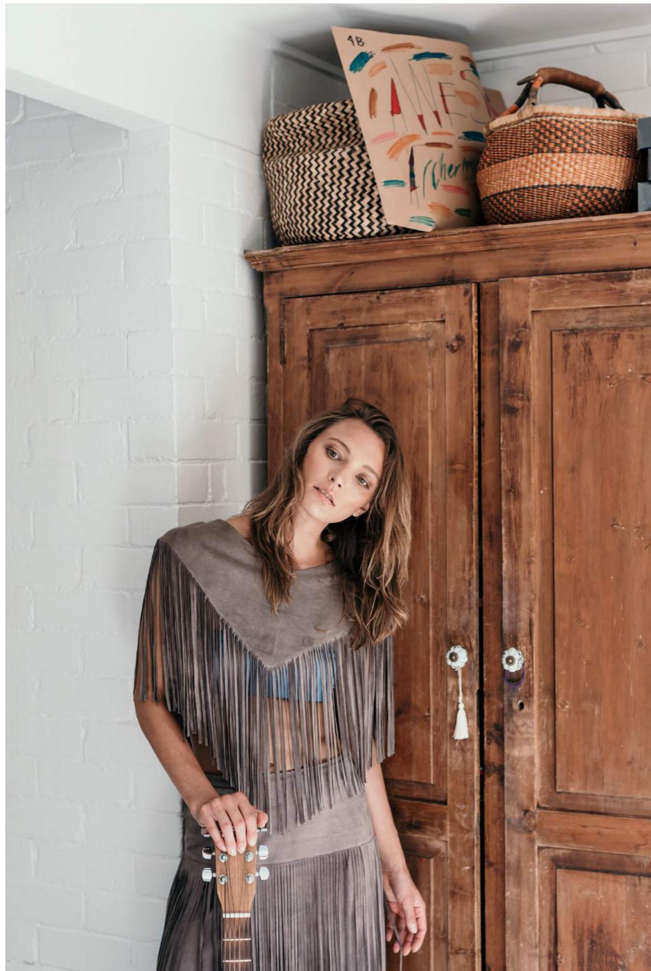
sweet sorrento bandeau/ dove tres bien cape/ smokey grey tres bien skirt/ smokey grey