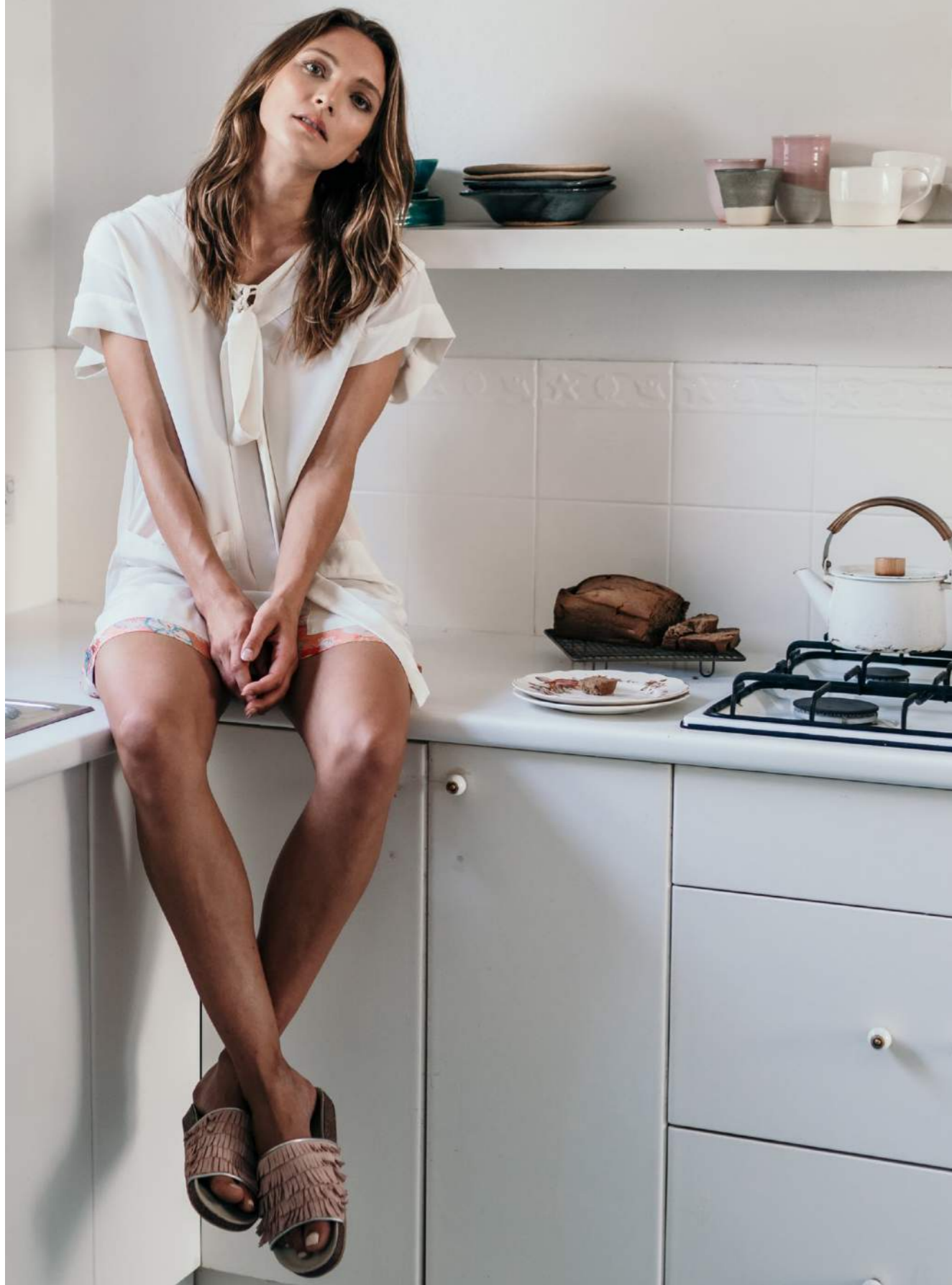
girl by sea tunic/ natural